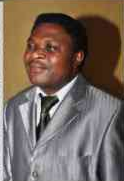
By Chris Irekpita

cross. That is why you find today, church multitudes which are more 'enemies-conscious' than being 'God-conscious'. They see what the enemies are "doing" in their lives more than what God is for them. Ironically, you only hear Jesus mentioned when they 'command enemies to die' and at the tail end of their long message when they use only about two minutes to invite the hearers to Christ. They end up not really preaching to them.