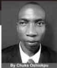
By Chusa Ostinigun