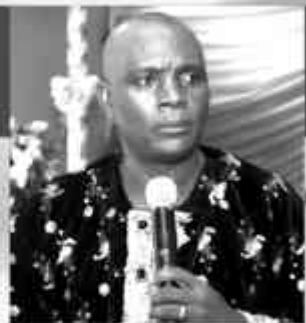
By A.S. David

Life is full of ups and downs. The struggle to survive the obvious obstacles and detours of life give rise to many mistakes and blame games. Mistake can be defined as 'being busy but not effective'. It could also mean doing the wrong thing at the right time. Failure is being successful in the wrong assignment. That is doing the right thing at the wrong time resulting in resistance.