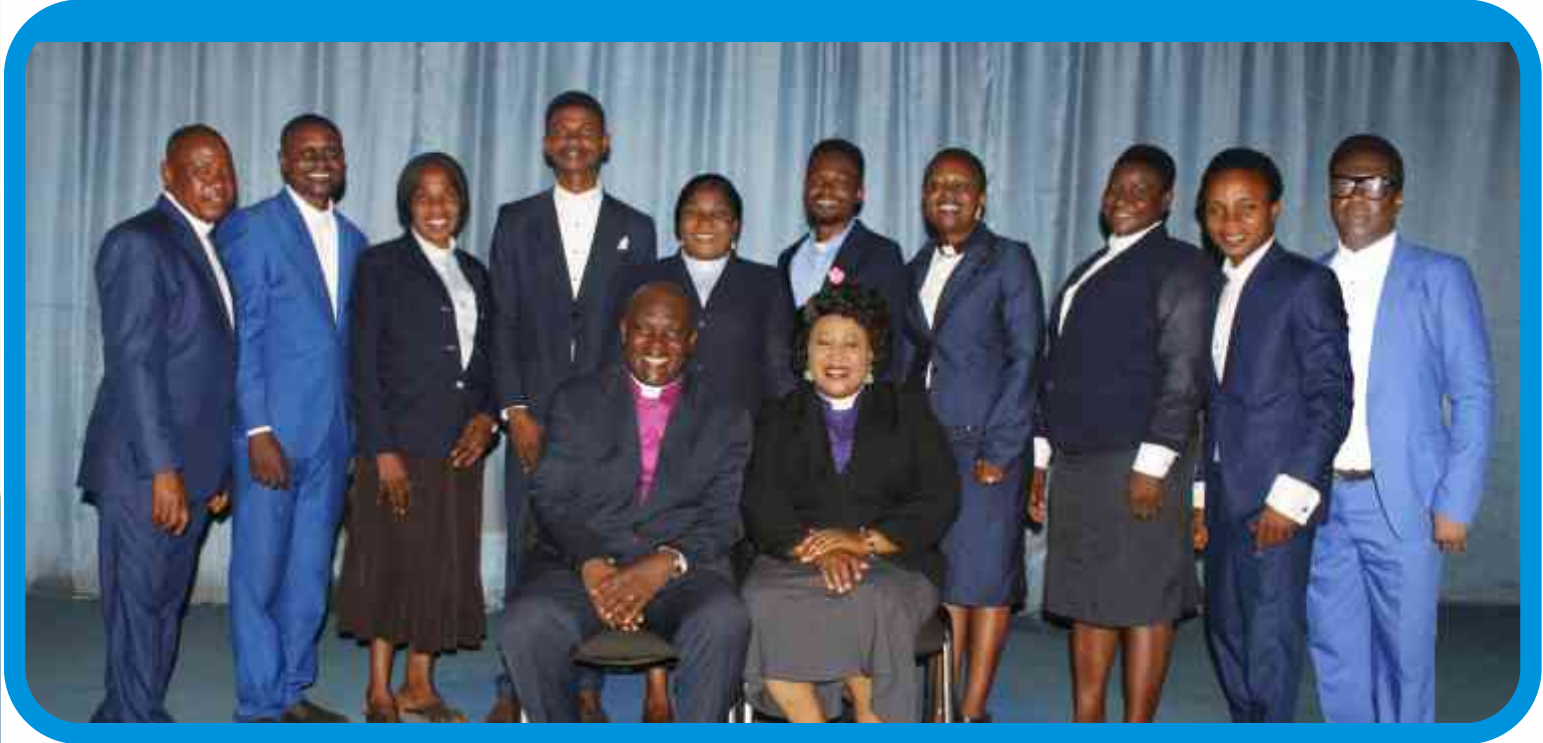
Pastors for Ordination 2020

OUR PRODUCT: People who live in love, grounded in faith, skilled in leadership & wisdom to communicate the gospel of the kingdom of God.