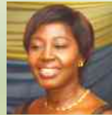
By Patricia Ohain (Mrs)

I t is a general assumption that women are of a weaker sex due to their physiological make up. What many fail to realize is that God has given women, just like their male counterparts, the same spiritual gift, grace and unction, to do the Kingdom business.