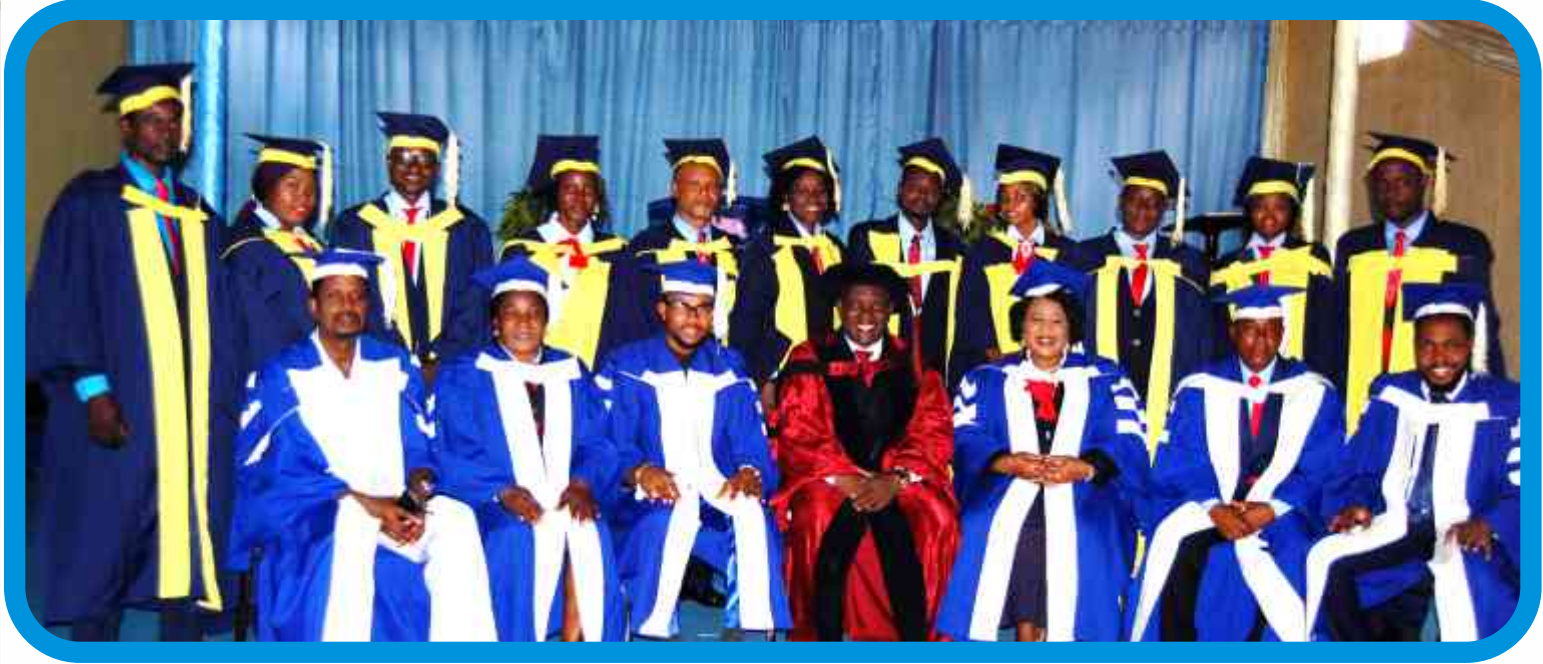
2020 Graduating Students of ILKS