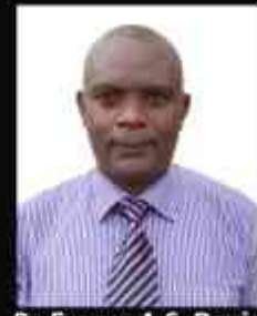
By Evang. A.S. David

Jesus taught with parables and without parables he did not teach. This indicates the importance of parables in bringing out the mysteries of the Kingdom of God for the benefit of humanity. These parables were meant to bring out clearly the kingdom that is little known, yet the hope of man's security, prosperity and peace.