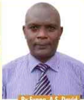
By Evang. A.S. David

L eadership is influence. A mission is the effort of man to bring the governmental influence of the kingdom of God to the Nations of the world.