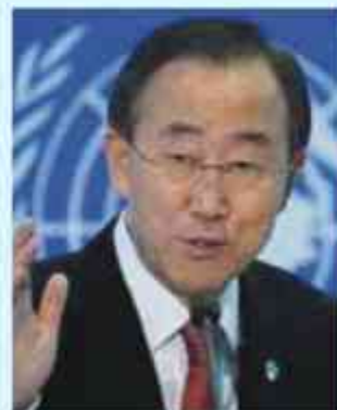
Ban ki moon